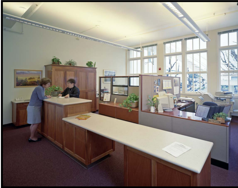
Napa Historic High School Student Services

Improvements vary depending on existing configurations