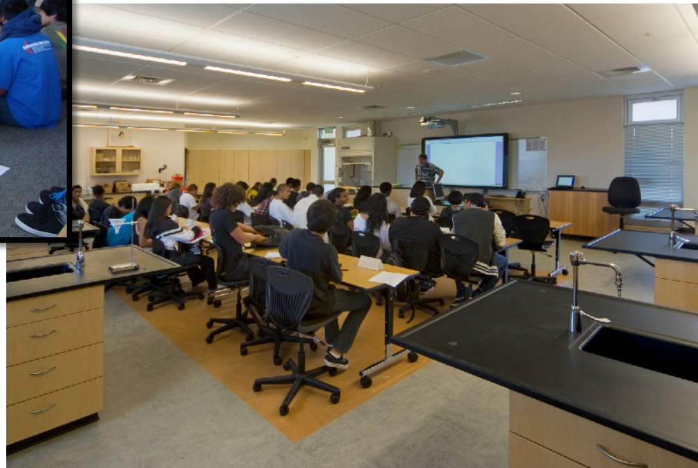
American Canyon High School Science Lab