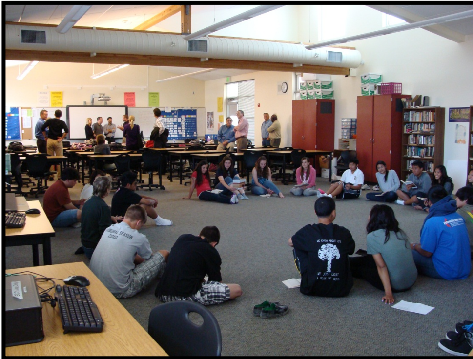
American Canyon High School Collaborative Classroom

Improvements vary depending on existing configurations