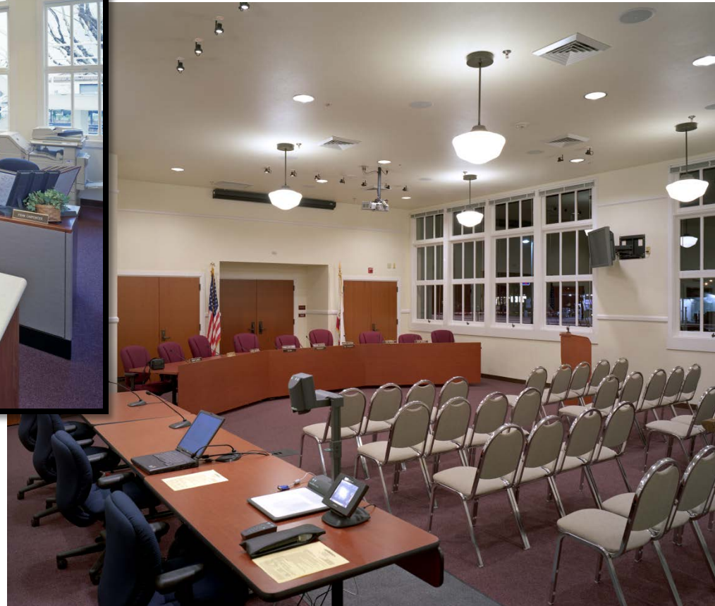
Napa Historic High School Presentation Space with Infused Technology